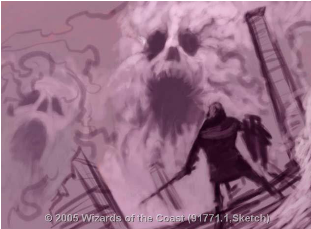
Thunderheads sketch by Hideaki Takamura

The first sketch does indeed depict "cloud-faced guardians", but these resemble howling evil spirits more than weirds. It's that composite form of two elements, plus a more stoic, neutral expression, that the art team wanted Takamura-san to go for.