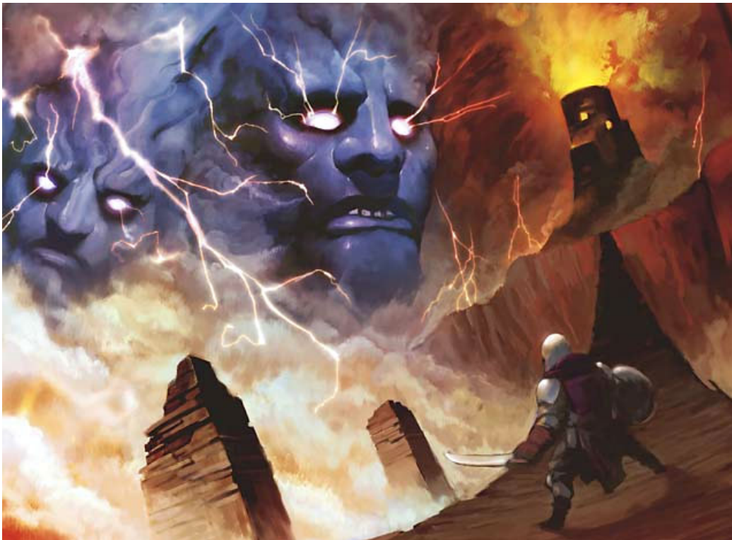
Thunderheads final art by Hideaki Takamura