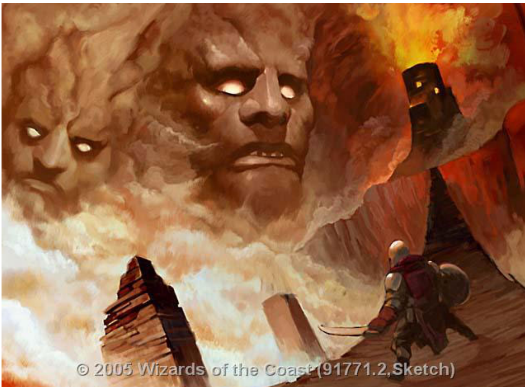
Thunderheads sketch by Hideaki Takamura

Quite departure from the first sketch, as you can see. And this is not so much a sketch, actually, as a final submission that was modified in production. The art team felt that while the cloud-faces captured much better the stoic feel of a forboding Easter Island statue, they lacked the composite-element look required by Weirds. In the final art, bolts of lightning and a blue cast were added to emphasize these creatures' natures as beings of elemental vapor and lightning forced together into an Izzet-serving whole.